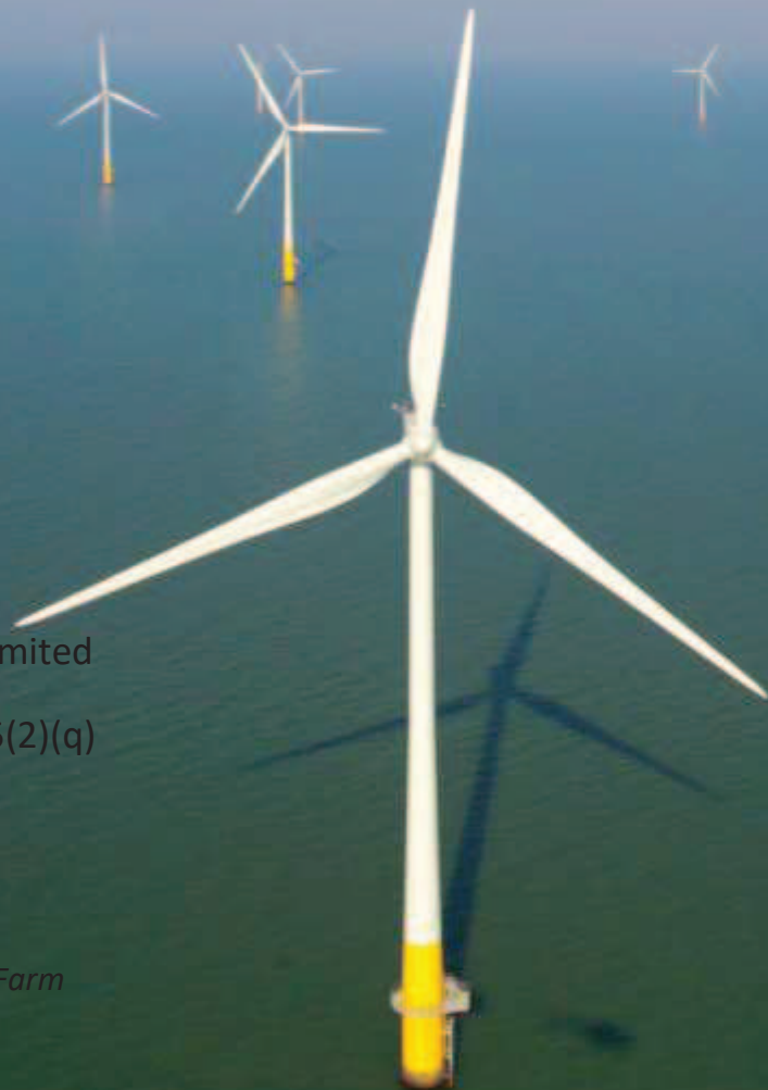
Photo: Kentish Flats Offshore Wind Farm

Date: June 2018 Revision: Version 1 Author: BECG